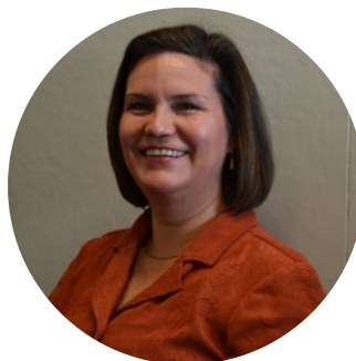
Confidential Imelda Genovese Superintendents Office