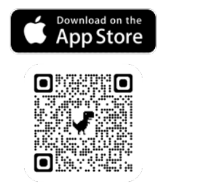
Scan the QR code or visit: http://bit.ly/45i8Nml